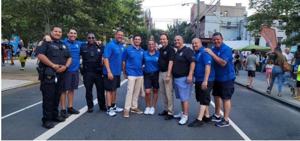
CAPTION: Hundreds attended Hoboken's National Night Out 2022.